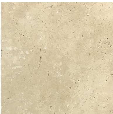
Tumbled and Unfilled